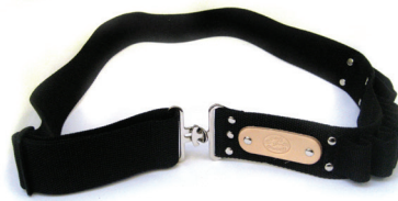
Traditional quick release steel buckle