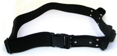
Nylon side-squeeze version.