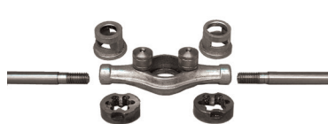
20mm and 25mm conduit die set

Suitable for threading black-gas or galvanized iron pipes. The compact ratchet head is suitable for working close to walls etc. The cast iron die heads have alloy steel dies, four chasers per head for a clean accurate thread and four waste holes for quick dispersion of swarf. Supplied in a blow mould carrying case with: 16, 20, 25 and 32 mm die heads, two-piece handle, compact ratchet head.