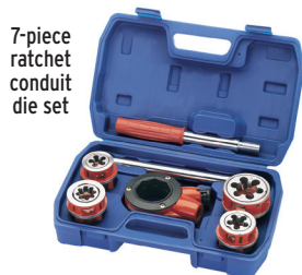
7-piece ratchet conduit die set